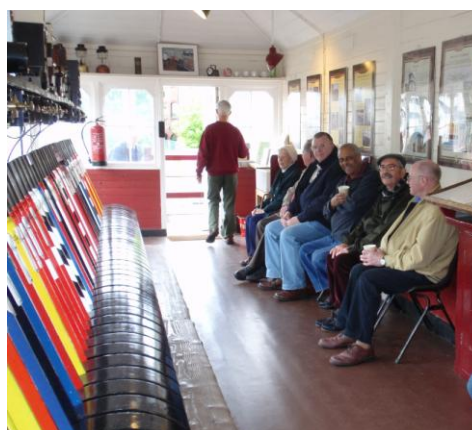
Waiting for the signalling demonstration

In 1863 the Midland Railway Act was passed by Parliament authorising the building of a line from Bedford through Luton and St Albans to London St Pancras. The line was opened on 13 th July 1886. The Signal Box helped control passenger traffic and the many freight trains that passed through St Albans. With modernisation the Box closed December 1979. It was listed by the Department for the Environment as an historical building but sadly was left to deteriorate until 2002 when the St Albans Signal Box Preservation Trust came into being. Over the next few years the Trust gradually restored the all timber construction to what you see today. The Box looks resplendent, painted in original Midland Railway colours. Inside only the lever frame had been retained but the Trust acquired other appropriate examples of equipment to enable a complete working environment to be created.