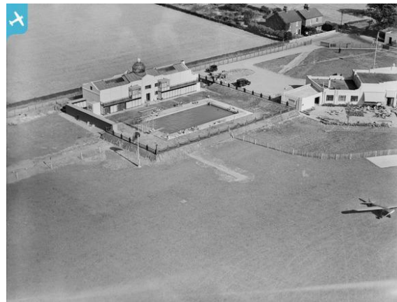
Hatfield Aerodrome swimming pool Hatfield 1933.

Registering is simple and easy, allowing you to use all the website functions.