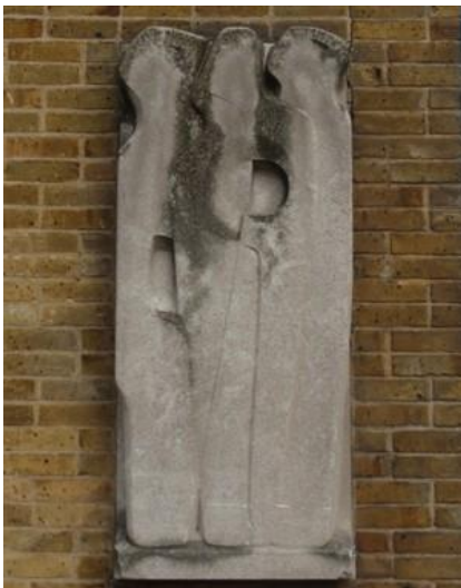
Vertical Form (1952) Barbara Hepworth

The second is by Barbara Hepworth (10 January 1903 – 20 May 1975) who was an English sculptor. Her work exemplifies Modernism and with such contemporaries as Ivon Hitchens, Henry Moore, Ben Nicholson, Naum Gabo she helped to develop modern art (sculpture in particular) in Britain.