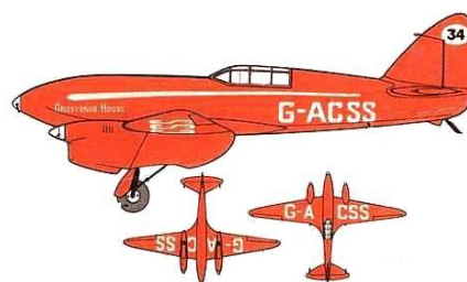
de Havilland DH88 Comet Racer

There will be a short film and an opportunity to look at a very interesting exhibition about Hatfield’s aviation heritage, as well as having a look at some of the Libraries local history resources and at the “Our Hatfield” website.