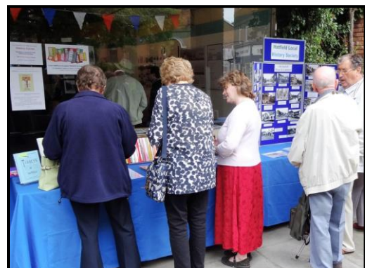
Our busy stall