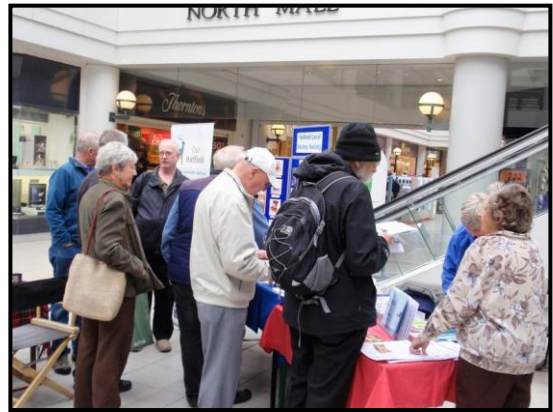
Our busy stall at the last Heritage Fair.

Come along and join us and other heritage organisations. There will be interesting exhibitions and displays throughout the day