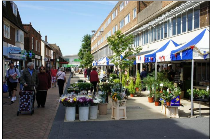
St Albans Rd, Hatfield Town Centre, now with the market running through.

All meetings are held at Friendship House, Wellfield Close, Hatfield. AL10 0BU £1 members & £2 non-members