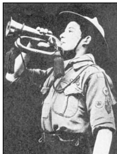
Hertfordshire Scout Bugler 1915

Monday 11 th December 2.15pm for a 2.30pm start.