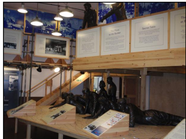
The Filter Room Telling the stories of 'The Many'