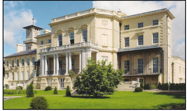
Bentley Priory: The house designed by Sir John Soames

When we arrived we had tea/coffee and then went on a tour of the Museum with an excellent guide. We were told about one of the most important stories of modern history, how the Battle of Britain, between 10 July and 31 October 1940, was won.