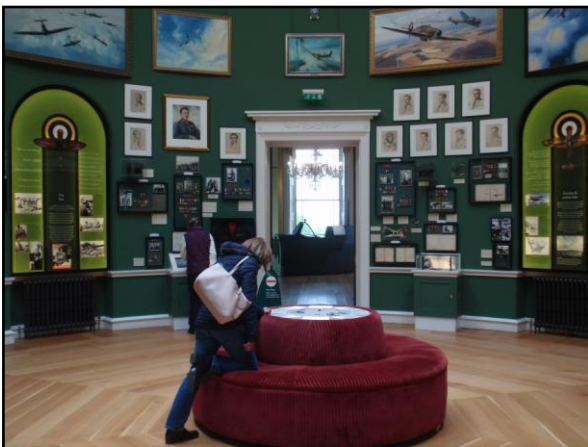
The Rotunda Telling the stories of 'The Few'.

After the tour and lunch, we were able to look around the Museum in our own time before returning to Hatfield mid afternoon. I am sure all who went had an enjoyable time, going home with a greater appreciation of what happened during this time.