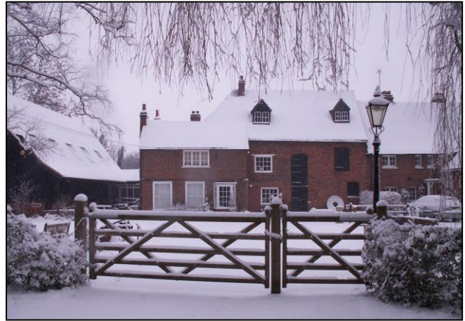
A wintery scene at Mill Green Mill & Museum

All meetings are held at Friendship House, Wellfield Close, Hatfield. AL10 0BU £1 members & £2 non-members