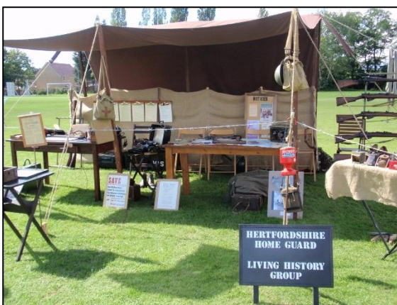
One of the Hertfordshire Home Guard Living History Group's displays