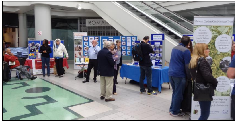
Displays at the Heritage Fair

Our Society's display showed photos of Old Hatfield shops. Many busy shoppers stopped to have a look. The photos brought back memories for some who had spent their childhood in Hatfield but had moved away in adult life.