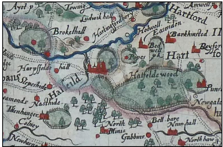
1598 Norden Map showing Hatfield and surrounding area

Mon 12 th Dec. 2.15 for a 2.30 start. Christmas open meeting